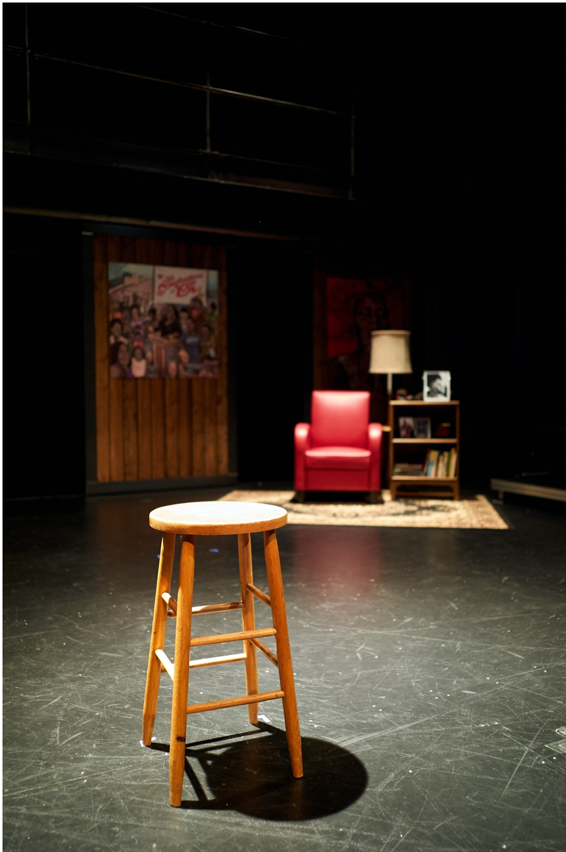
STAGE PLOT